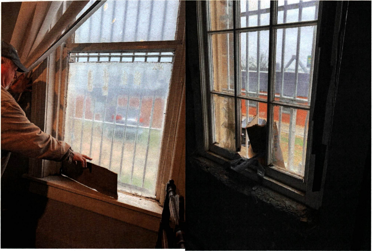
2. Termite Damage: