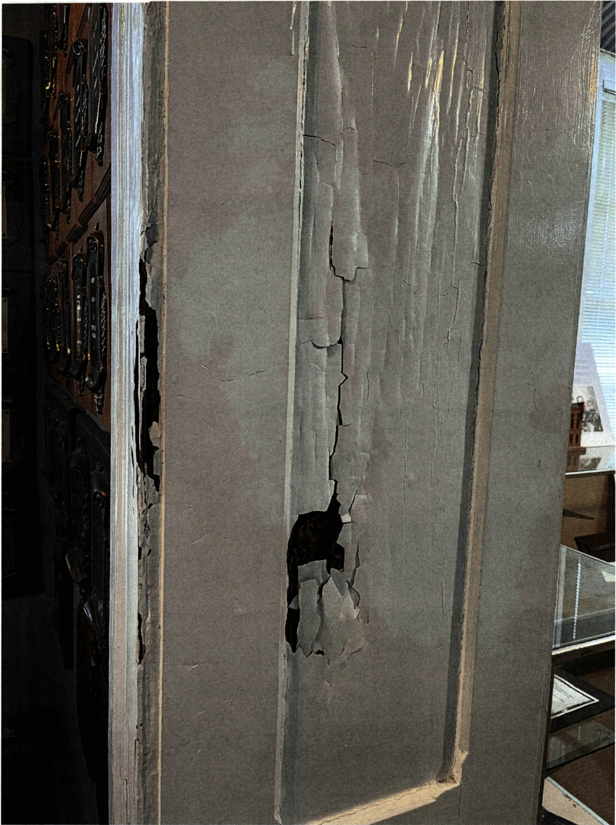
3. Lights and Junction Box: